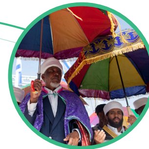
Religious Pluralism and Tolerance