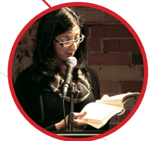
Canadian Outreach and Education