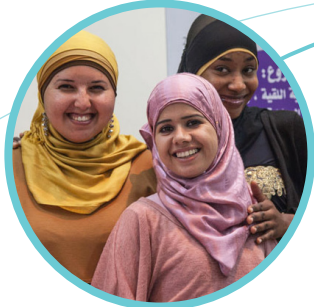
Civil and Human Rights